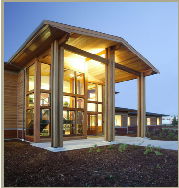
Simpson Company Headquarters; Tacoma