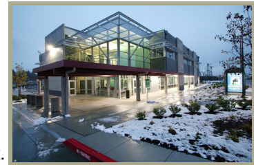
Pierce Transit Office/Training Building

New construction and renovation, shell & core and TIs, all types of materials – we do it. Our portfolio includes offices, factories, retail, residential, warehousing, churches, private schools and more. Our Special Projects department handles small, miscellaneous work.